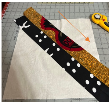
2 nd strip added