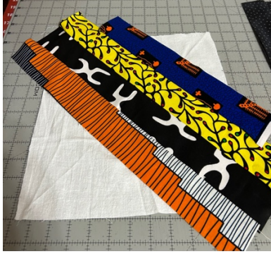
Keep adding strips to each side