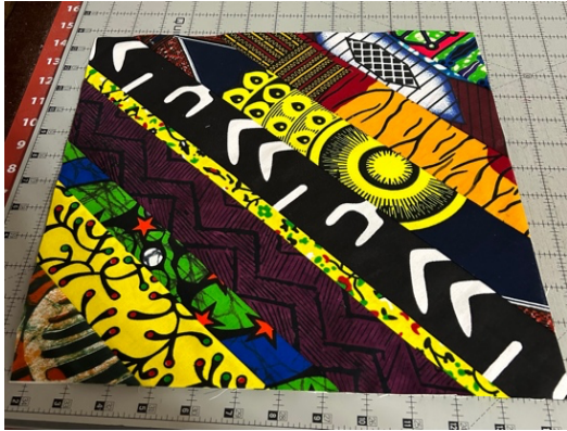
Block to complete for OPPORTUNITY QUILT