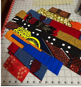
Block complete with strips added