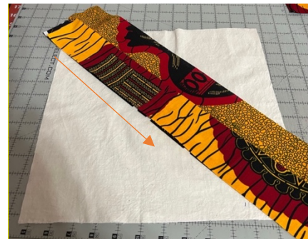
Add 3 rd strip on other side