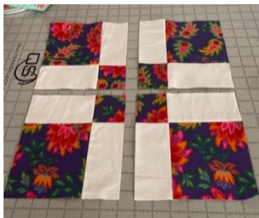
Example 4 – cut into 4 piece