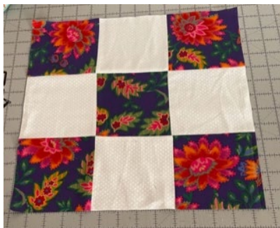
Example 1 - placement

Once you have your 9 patch sewn together trim to 13 ½” square (see example 1 ) Take your ruler and from the center (see example 2 ) measure 2 ¼” to cut horizontally Next measure 2 ¼” again from center (see example 3 ) and cut vertically You will have 4 pieces which should measure 7 x 7 (see example 4 ) Next is placement of each 7 x 7 pieces to make your block (see example 5 )