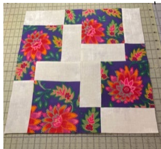
Example 5 – Block arrangement