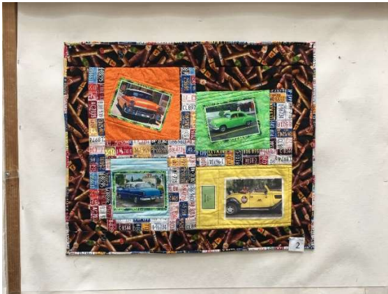
DOLORES VITERO PRESLEY