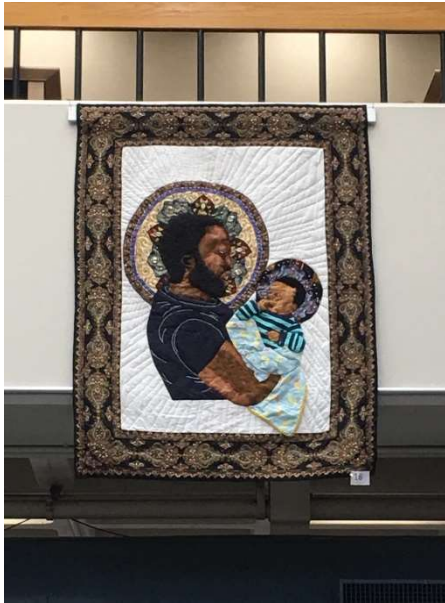
LA QUITA TUMMINGS