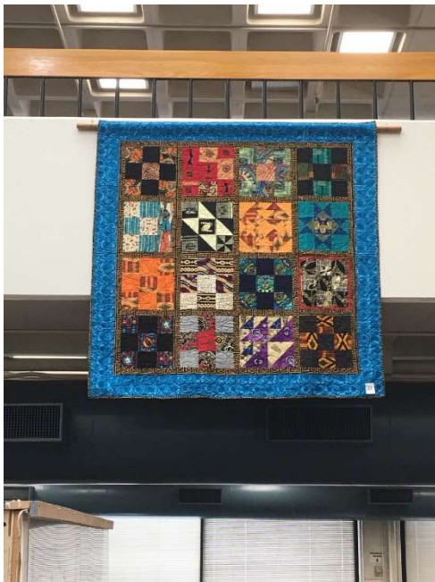
DOLORES VITERO PRESLEY