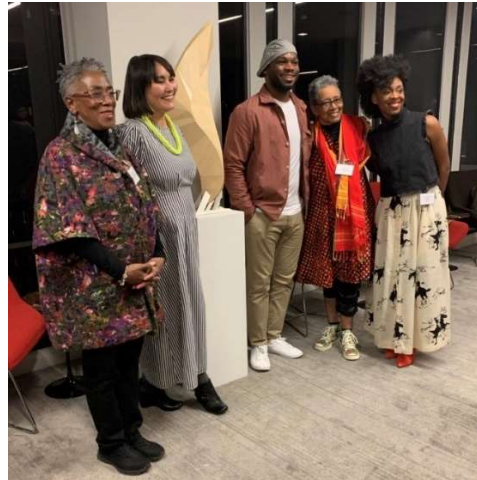
Four of the exhibitors with curator