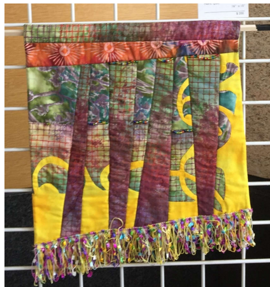
Dolores Vitero Presley "1+1+1+1=5"