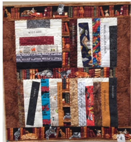
Ernestine Tril LIBRARY BOOKS