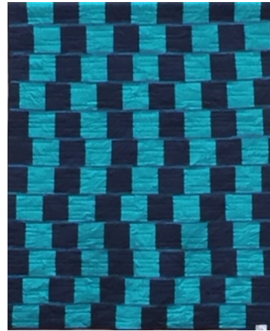
Dolores Vitero Presley OPTICAL ILLUSION