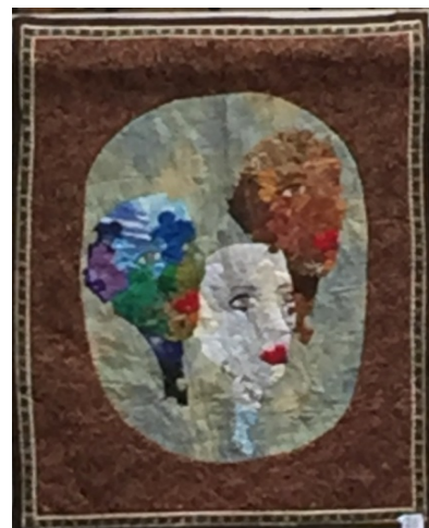
LaQuita Tummings HUMAN PIECES