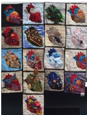
LaQuita Tummings CORAZON