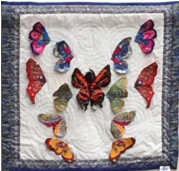
LaQuita Tummings BUTTERFLIES