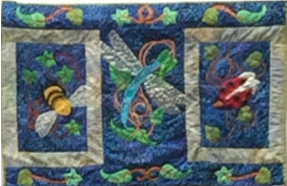
LaQuita Tummings BUGS