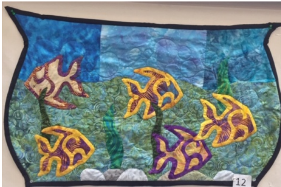
LaQuita Tummings FISH BOWL