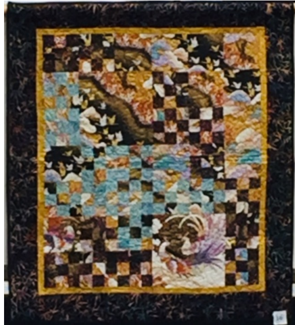
Suzi Taylor BIRDS IN FLIGHT