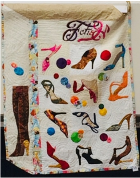
LaQuita Tummings FETISH FOOTWEAR