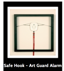
Safe Hook - Art Guard Alarm