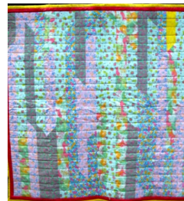
Jelly Roll Rookie