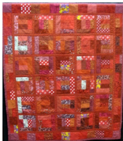
Quilter's Quest 2012