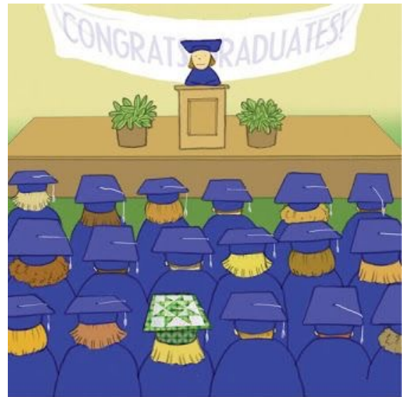
It is easy to spot a quilter in a crowd.