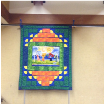
Poetry Slam Teri Green