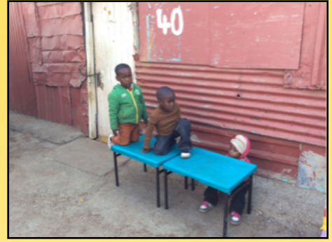
Children outside childcare center in township. These children are in great need of clothes and supplies and tour members brought items to give to them.