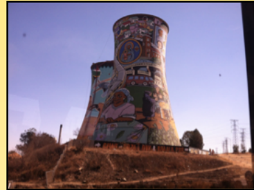
Soweto Grocery Store and deactivated nuclear power plant towers now public art.

The International Quilt Convention was held over three days. They had a good turnout although the event was small in comparison to PIQF and other US quilt festivals. But there are always places to spend money.